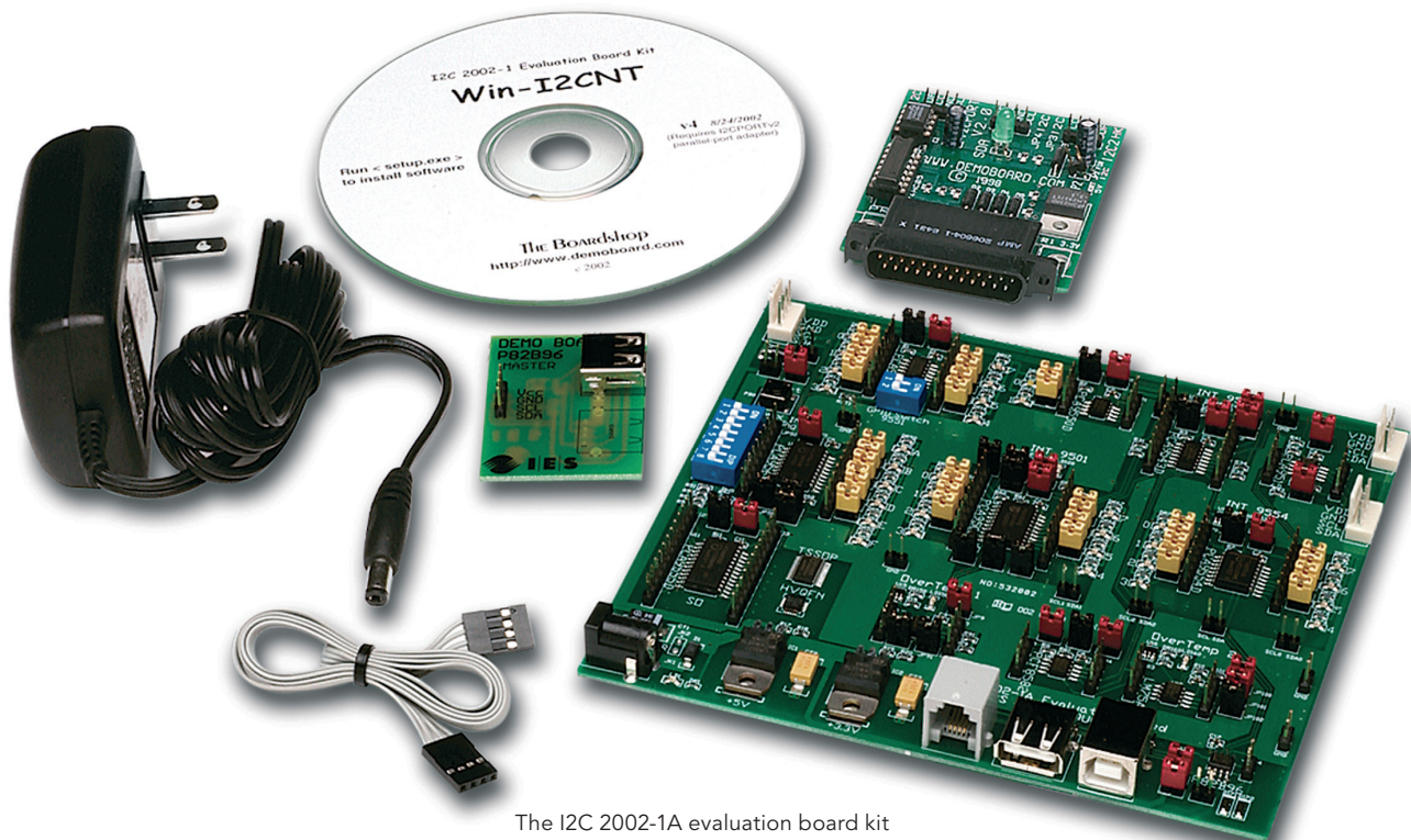
The I2C 2002-1A evaluation board kit

Purchase either board at www.digikey.com or www.demoboard.com .