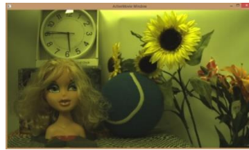
Camera Tool view mode