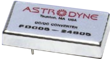
Unit measures 1"W x 2"L x 0.375"H