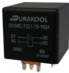
PCB version pictured