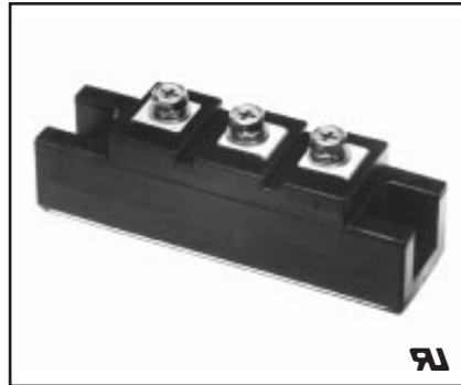
CDD11210, CDD11610 Dual Diode POW-R-BLOK™ Modules 100 Amperes/1200-1600 Volts