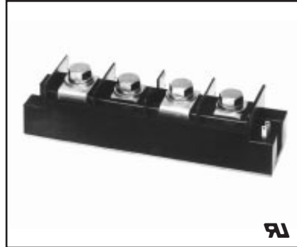
CD511225, CD511625 Dual Diode POW-R-BLOK™ Modules 250 Amperes/1200-1600 Volts