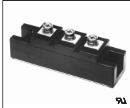
CD411230, CD411630 Dual Diode POW-R-BLOK™ Modules 30 Amperes/1200-1600 Volts