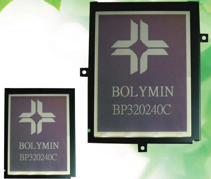
(Options : Frame without ears)