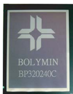
(Options : Frame without ears)