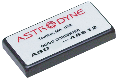
Unit measures 1"W x 2"L x 0.25"H