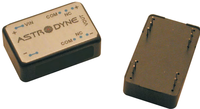
Unit measures 0.8"W x 1.25"L x 0.5"H