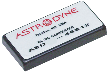
Unit measures 1"W x 2"L x 0.25"H