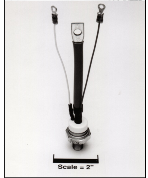
2N1909-2N1792 Phase Control SCR 70 Amperes Average (110 RMS), 600 Volts