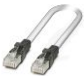
Patch cable, CAT5, assembled, 2 m

Patch cable - FL CAT5 PATCH 2,0 - 2832289