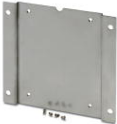
Mounting plate for FL SWITCH 30... and FL SWITCH 40... eight-port switches

Please be informed that the data shown in this PDF Document is generated from our Online Catalog. Please find the complete data in the user's documentation. Our General Terms of Use for Downloads are valid ( http://phoenixcontact.com/download )