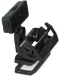
HEAVYCON EVO panel mounting base, plastic, D25, with single locking latch, flat gasket, and protective cover

Please be informed that the data shown in this PDF Document is generated from our Online Catalog. Please find the complete data in the user's documentation. Our General Terms of Use for Downloads are valid ( http://phoenixcontact.com/download )