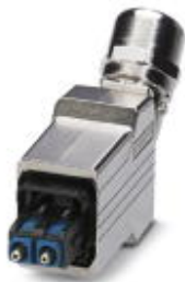
Push-pull connector (version 14), die-cast zinc, with SC-RJ insert for POF, for cable diameter of 5.5 mm ... 10 mm, cable outlet at the top

Please be informed that the data shown in this PDF Document is generated from our Online Catalog. Please find the complete data in the user's documentation. Our General Terms of Use for Downloads are valid ( http://phoenixcontact.com/download )