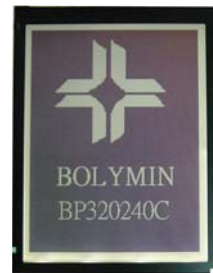
(Options : Frame without ears)